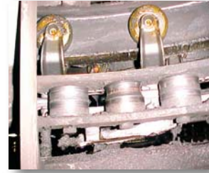
Rollers shown need to be replaced because of severe wear.

Health Assessments of your manufacturing systems including conveyors, process tooling and other equipment can be one of the best investments you make to minimize lost production and the costs associated with catastrophic failures. It can literally pay for itself many times over by allowing you to anticipate failures and plan remediation rather than react to it. Design Systems teams of trained engineering specialists can quickly assess your plant equipment for potential failures with no disruption to your production.