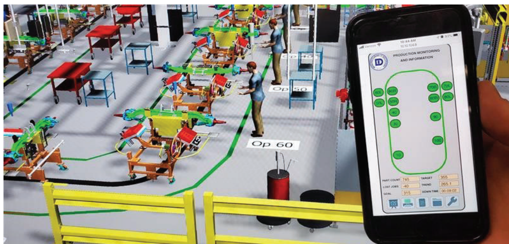
Line Statistics Last 8 Hours